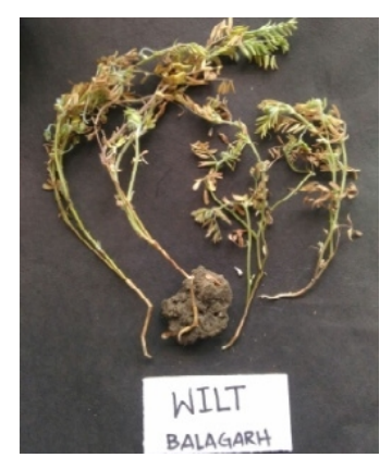
Fig. 2. Typical symptom of Fusarium wilt.