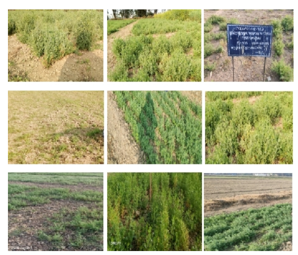
Fig. 1. Survey on the natural incidence of Fusarium wilt of lentil in different locations of West Bengal.

Areas Surveyed. The survey on the incidence of Fusarium wilt of lentil was conducted between